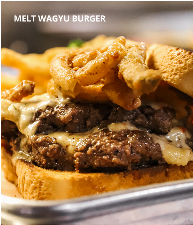
MELT WAGYU BURGER

PULLED PORK or CHICKEN SANDWICH ,CHOICE OF SIDE, COOKIE $12 PER BOX