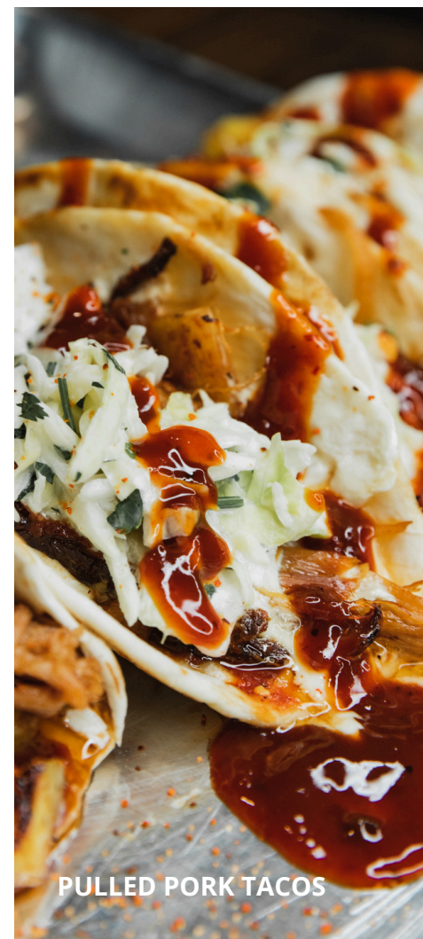
PULLED PORK TACOS