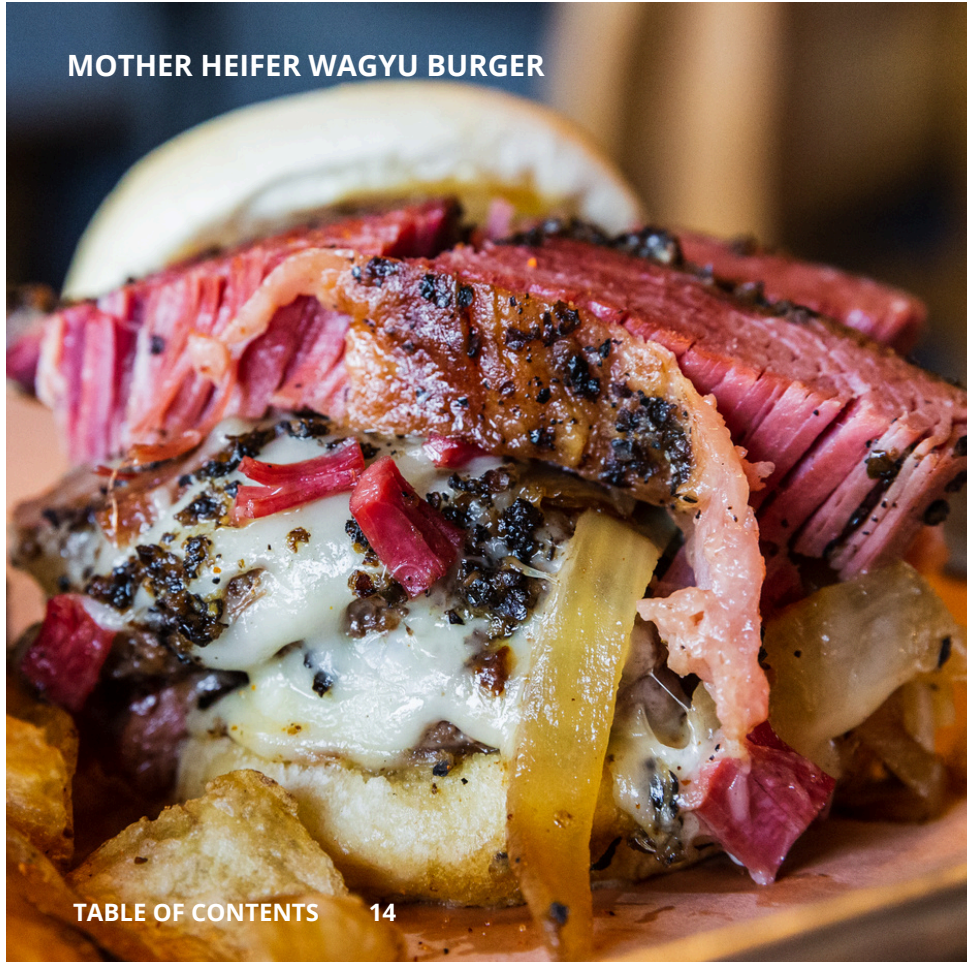
MOTHER HEIFER WAGYU BURGER