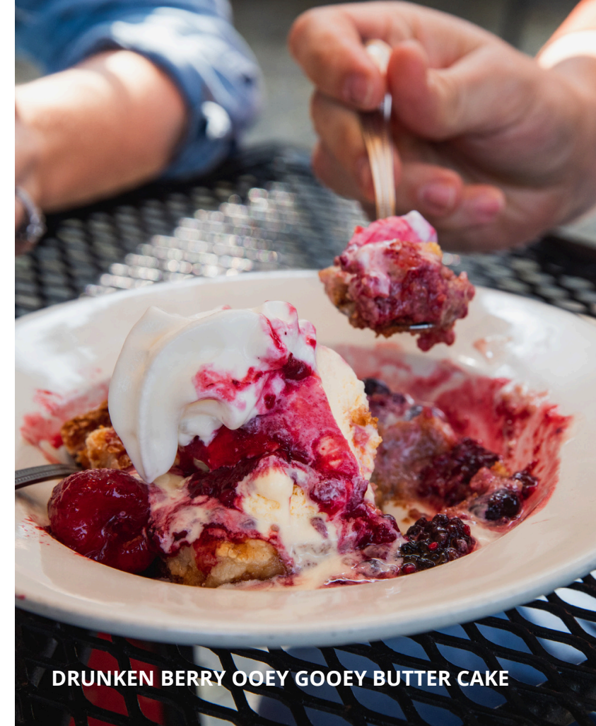
DRUNKEN BERRY OOY GOOEY BUTTER CAKE

This cake is named after it's stripes. Layer after layer of delicious chocolate cake, white chocolate mousse and dark chocolate goodness.