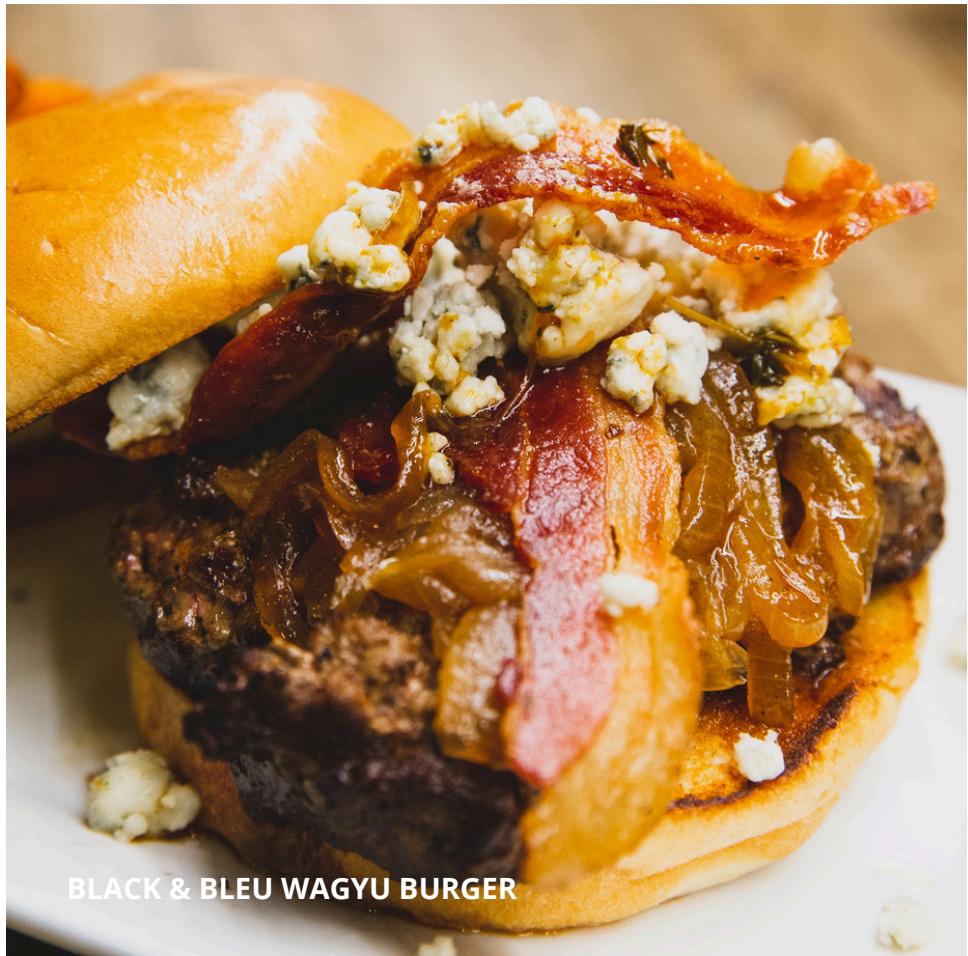
BLACK & BLEU WAGYU BURGER