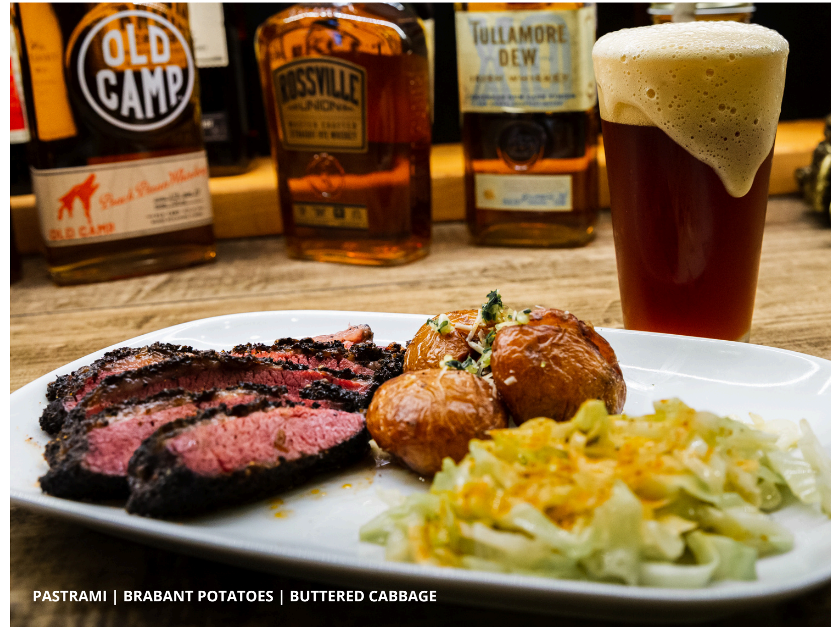
PASTRAMI | BRABANT POTATOES | BUTTERED CABBAGE