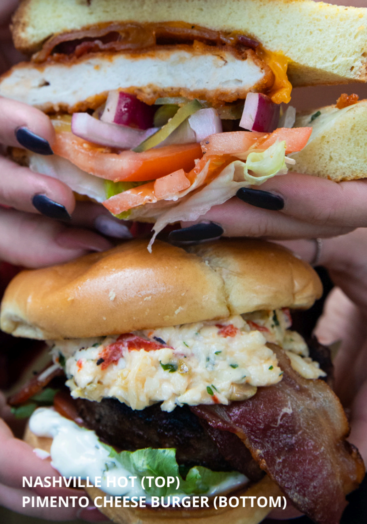
NASHVILLE HOT (TOP) PIMENTO CHEESE BURGER (BOTTOM)