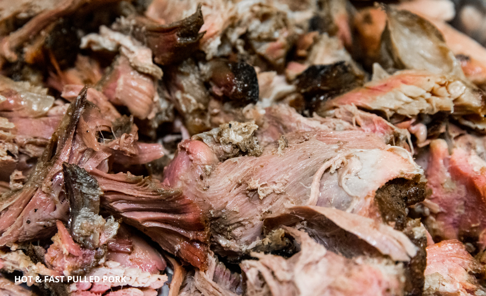
HOT & FAST PULLED PORK