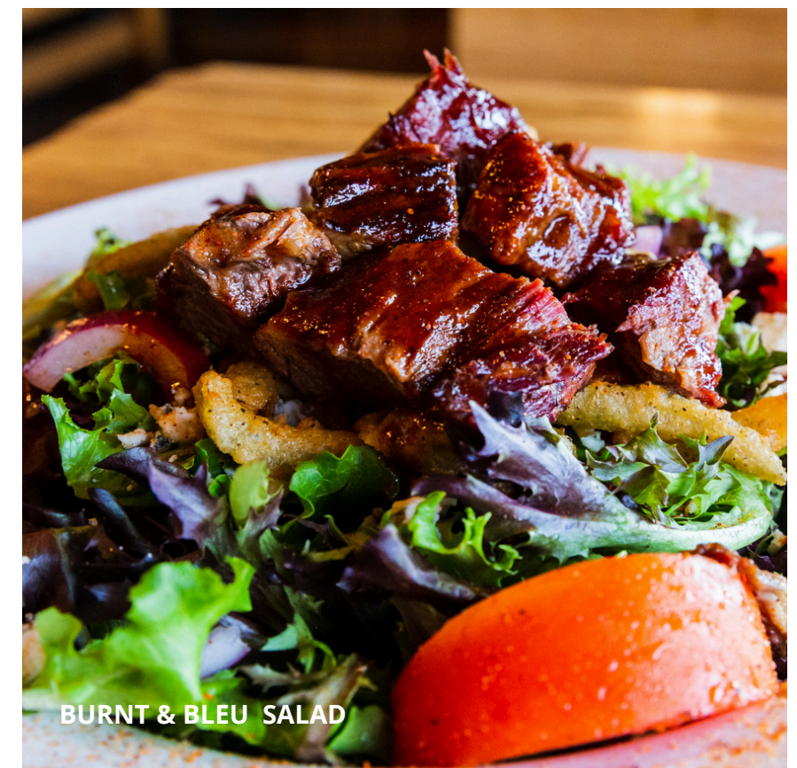
BURNT & BLEU SALAD