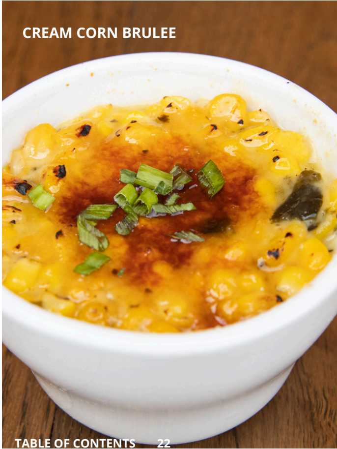
CREAM CORN BRULEE

BEANS GF $40 PER 1/2 PAN $80 PER FULL PAN