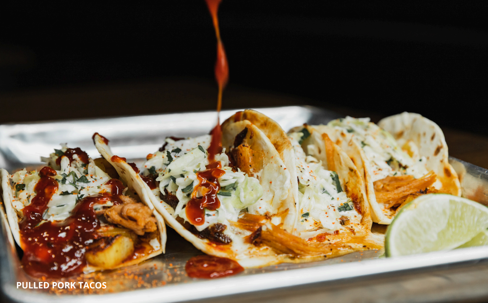
PULLED PORK TACOS