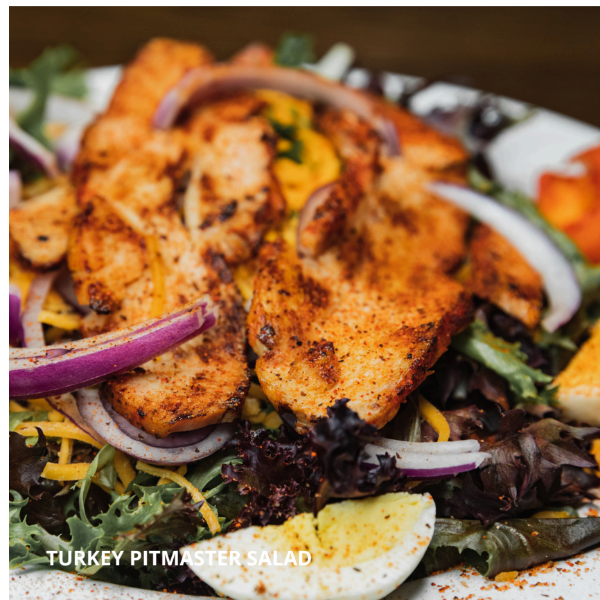
TURKEY PITMASTER SALAD

Spring mix, burnt ends, tomatoes, Bleu cheese crumbles, onionpenos, and "jallelujah" jalapeno dressing.