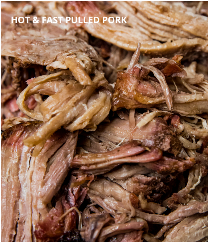
HOT & FAST PULLED PORK

TURKEY CLUB SANDWICH CHOICE OF SIDE, COOKIE $13 PER BOX