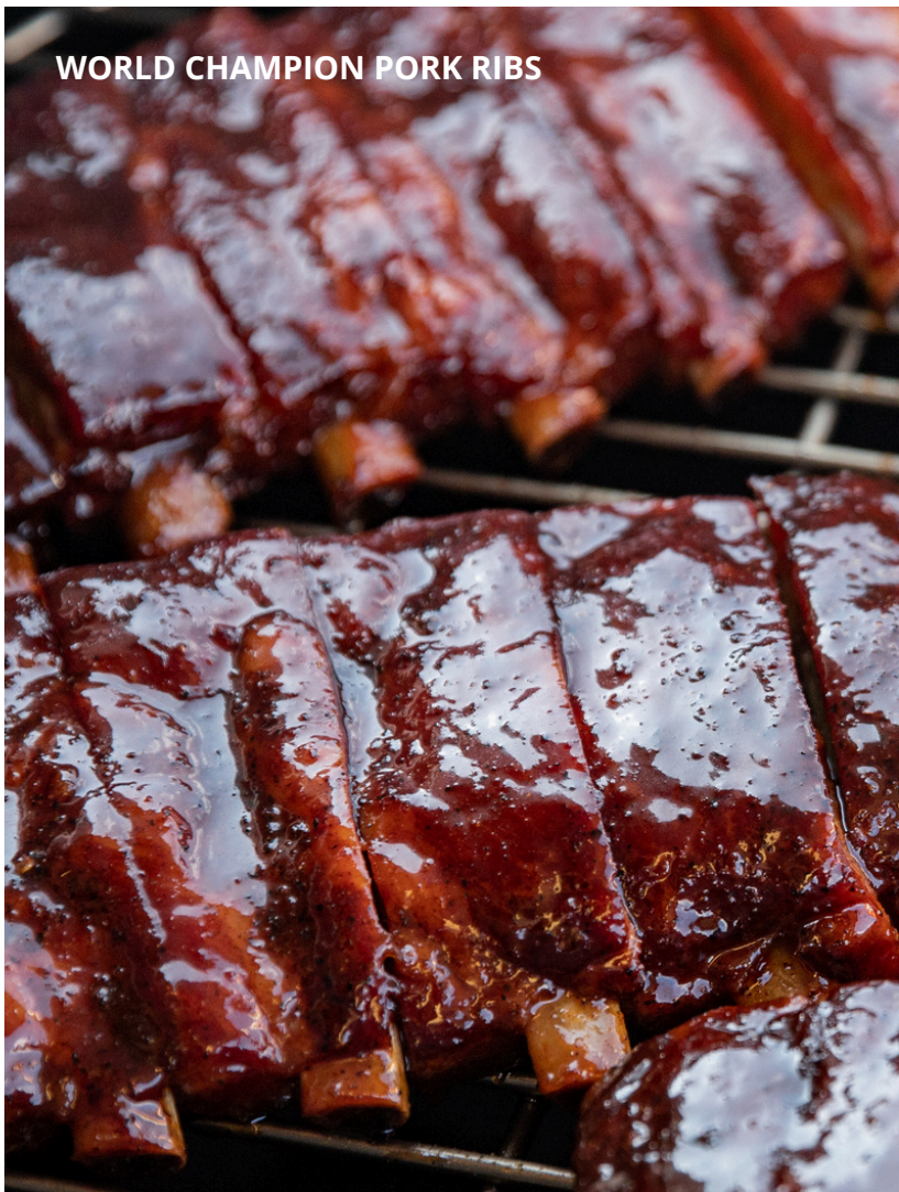
WORLD CHAMPION PORK RIBS