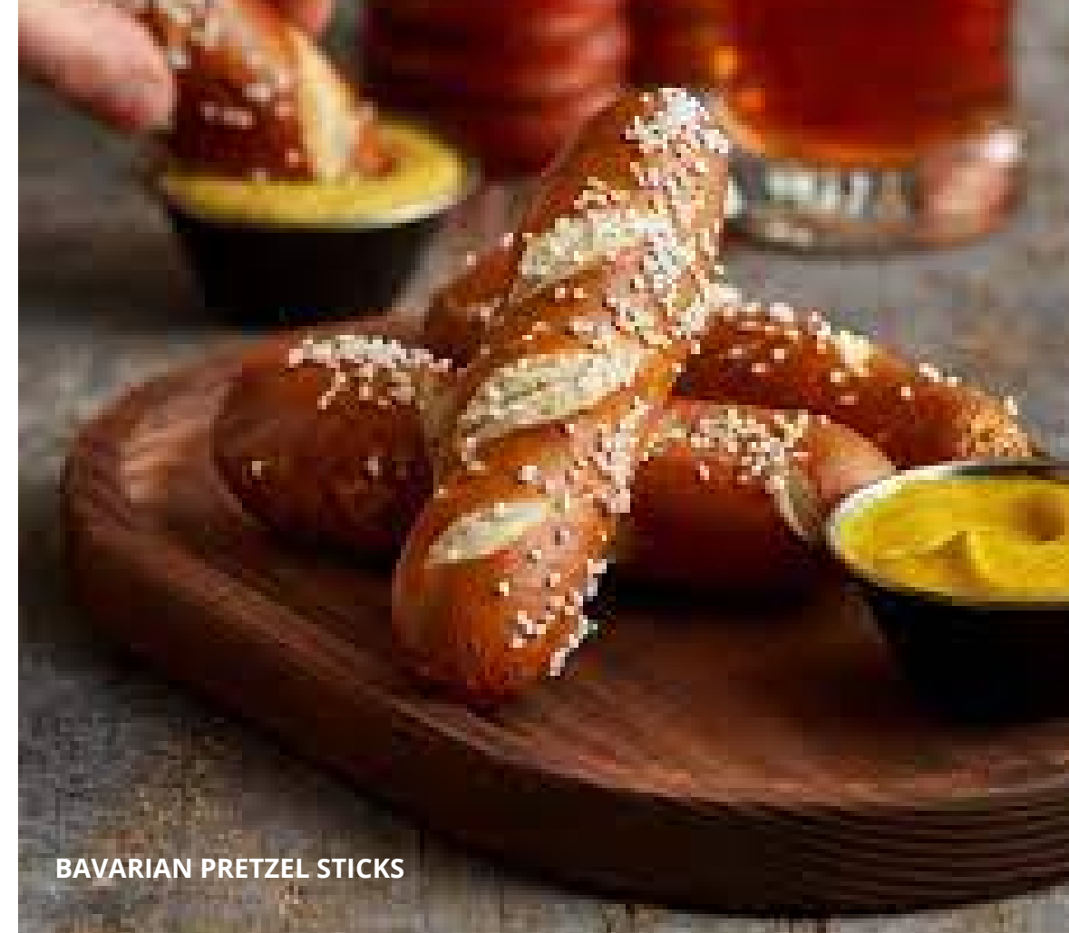
BAVARIAN PRETZEL STICKS

Enjoy our mini version of the Bavarian soft pretzel topped with the ideal amount of salt, and paired with queso and dijon mustard dipping sauces.