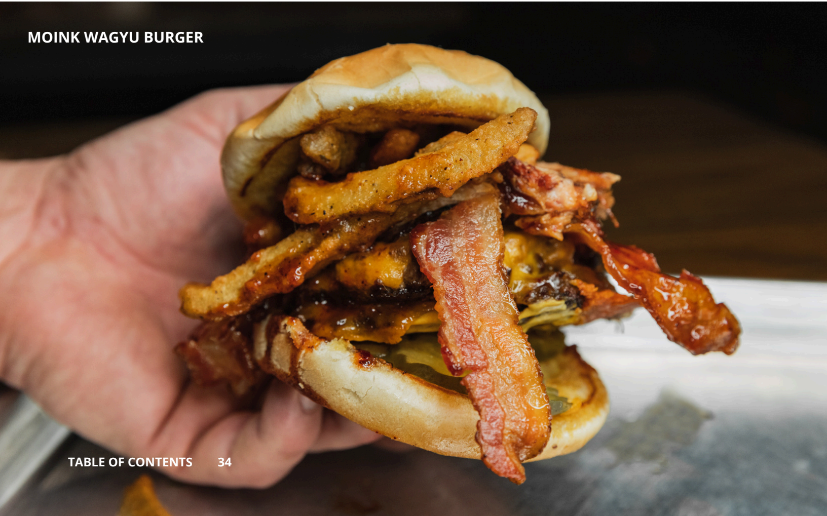
MOINK WAGYU BURGER