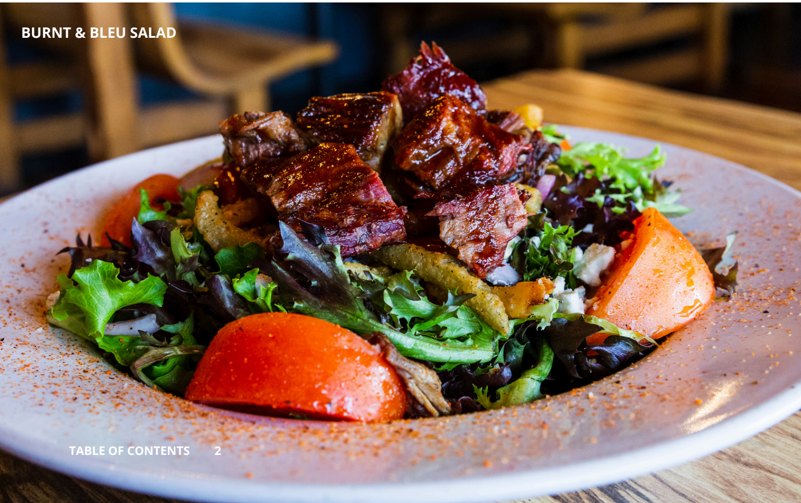
BURNT & BLEU SALAD

Finding a top-notch catering company who delivers excellent food AND five star service can feel like climbing a mountain without a secure line holding you. When climbing, the sweet spot comes when you have enough slack to get creative, while knowing the rope is tight enough to keep you safe. Same with catering. You should have the freedom to create the menu of your dreams, while being backed with a secure promise of unmatched service.